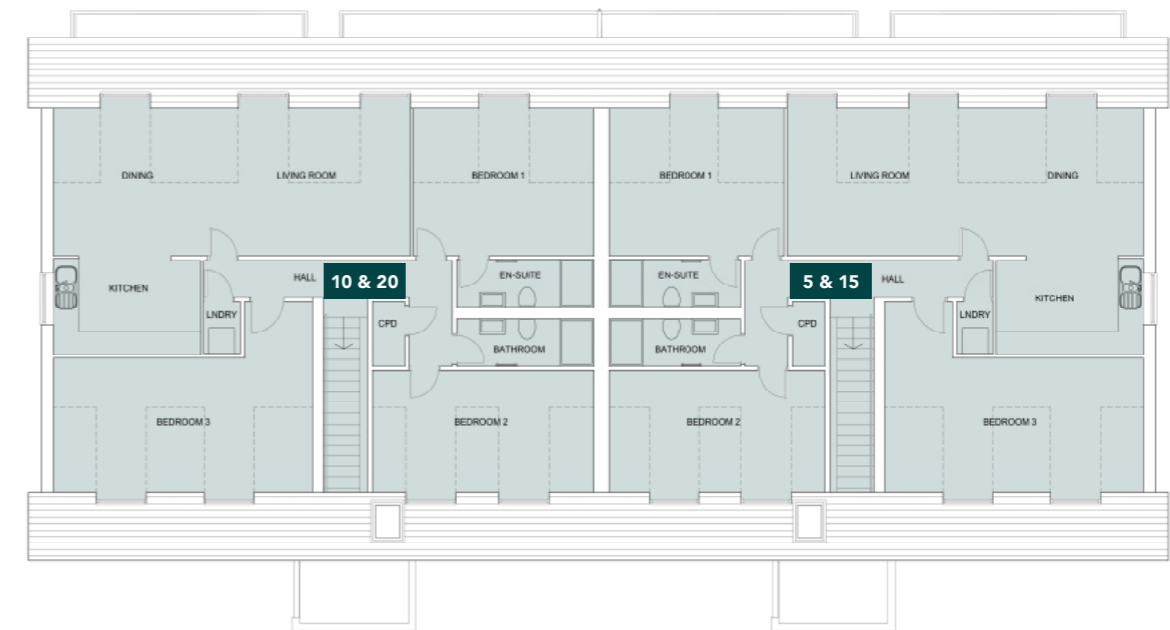
116 m 2 / 1246 ft 2 Apartment 10 & 20