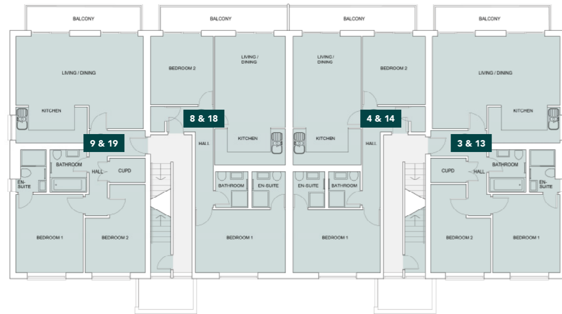
67 m 2 / 720 ft 2 Apartment 9 & 19