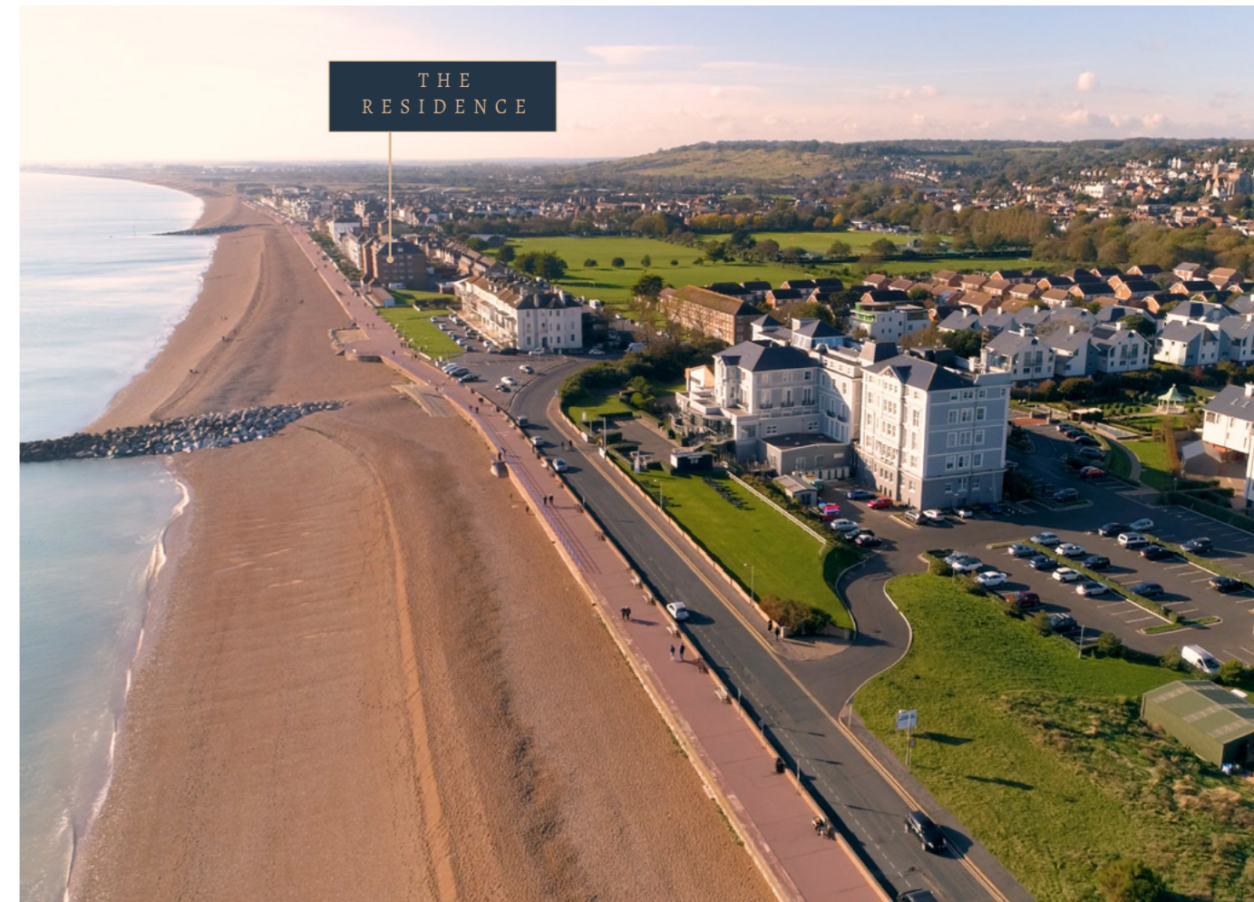
The Hythe Imperial Hotel

Although it is hard to tire of Hythe, there is much to see in the close vicinity. Take a nostalgic trip on the Romney, Hythe & Dymchurch Railway, spot wildlife at Samphire Hoe nature reserve or wonder at the 100 square miles of Romney Marsh wetlands. Also close by are Port Lympne Safari Park and Brockhill Country Park.